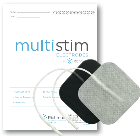
multistim carbon Film electrodes