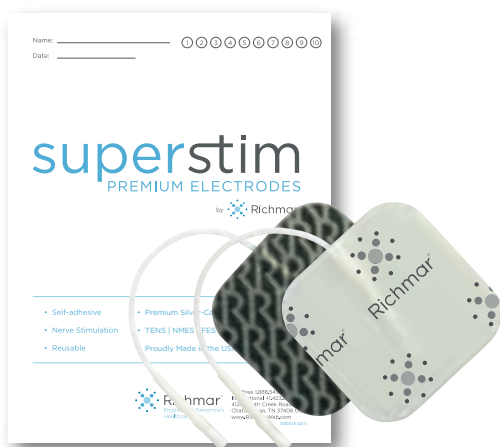
superstim premium Silver carbon Electrodes