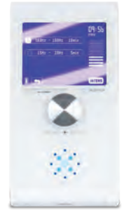
RM01009 Hivamat 200 Portable