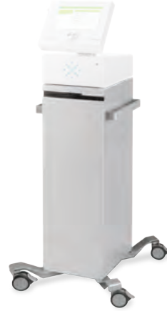
RM01004 Evident Trolley