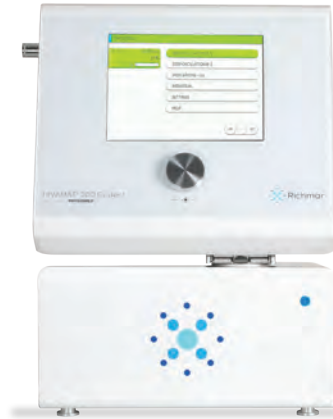
RM02037 Hivamat 200 Evident